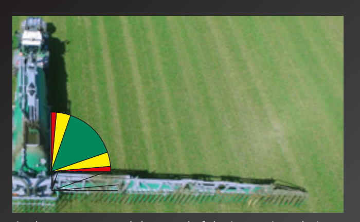
Angle sensors control the speed of the inner wings during folding. Green: Max. speed, Yellow: Reduced speed and Red: Boom stops.

SHB4-36 is optimised to the smallest detail to ensure increased application capacity and to minimise ineffective time. The folding speed is optimised when folding and unfolding the boom. The dynamic folding is fully automatic and takes place at several speeds. This ensures smooth and quick folding under all conditions. Folding is controlled fully automatically by SlurryMaster 8000, minimizing the risk of manual operating errors which may cause damage.