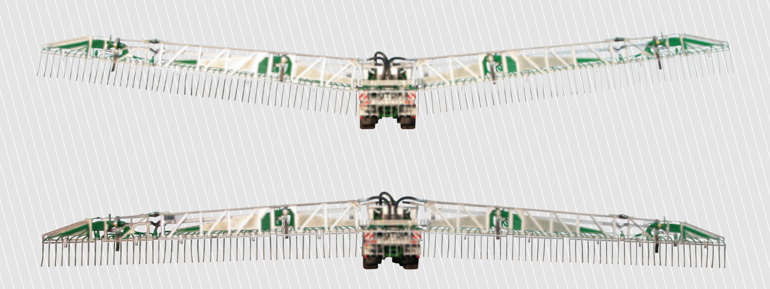
The side wings of the SHB4-36m boom can be adjusted individually both above and below level in relation to the central frame.

The side wings are folded in two layers using a planetary gear driven by an oil motor. This provides fully controlled and optimised rotation of the pivot joint and minimises the need to lubricate moving parts. A new hydraulic system allows the oil motor to cut out upon impact to avoid damage to the boom.