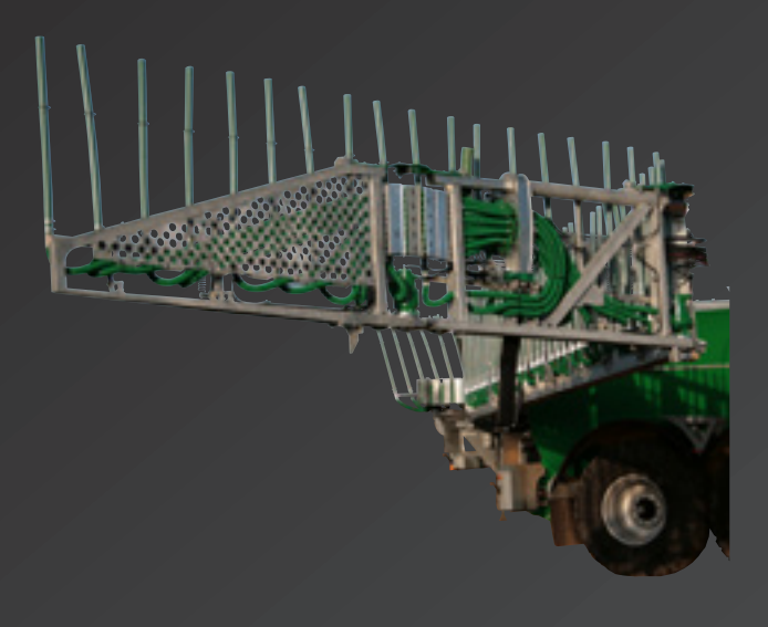
The new drip stop rotates the hoses so they point upwards.