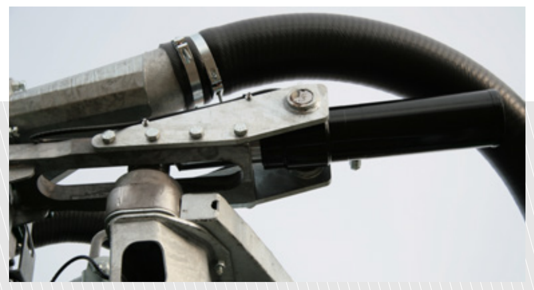
The two large side wings are hinged at the bottom and are controlled by a large hydraulic cylinder at the top.