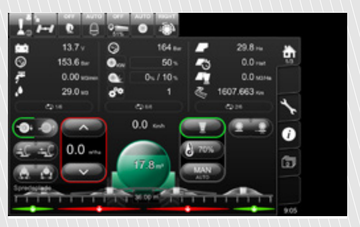
It is very easy to operate the new boom via the SlurryMaster 8000 control system. You can always see which distributers are in use.