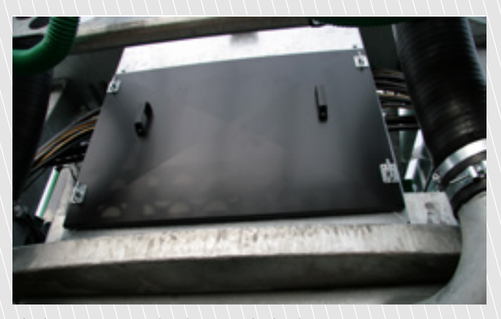
The boom is equipped with its own hydraulic system.

The boom is equipped with its own hydraulic system. This means fewer hydraulic hoses between the tanker and the boom.