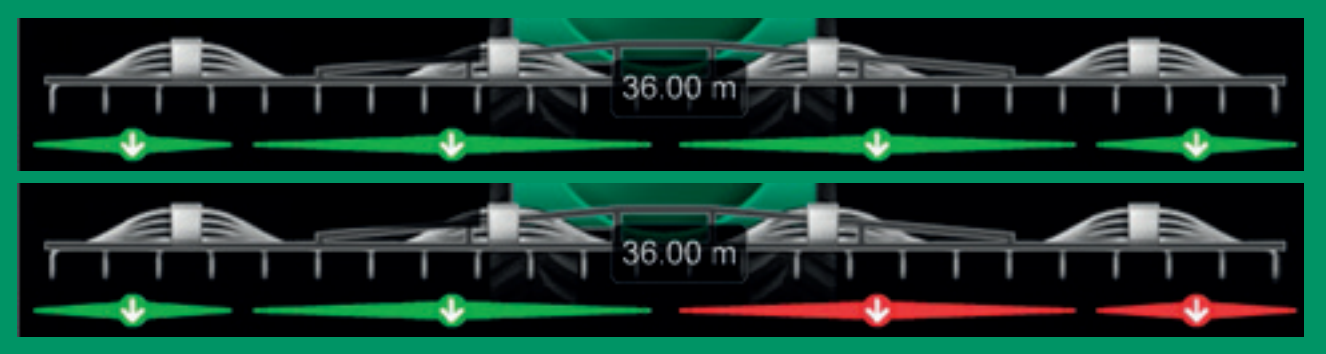
Sections can be closed off for each distributer. When sections are closed off, the amount of slurry is adjusted so dosing remains constant.

The improved opportunity for closing off individual sections reduces the overlap of slurry into wedges on the fields. This also reduces the risk of lodging.