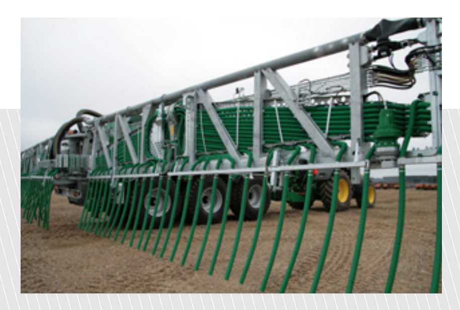
There are fewer "hose metres" in the new SHB4-36m drip hose boom.