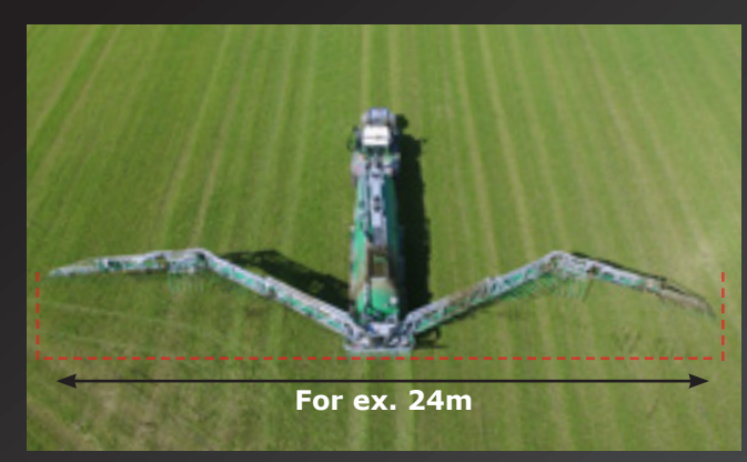
FBS increases both safety and capacity.

When unfolding near field boundaries and roads, FBS provides an ideal solution that eliminates unfolding over the desired working width. This allows the operator to drive up the first track alongside roads or boundaries to unfold the boom. This minimises unnecessary pressure damage to plants and soil and increases the efficiency of the machine set. FBS is standard on all SHB4-36m versions.