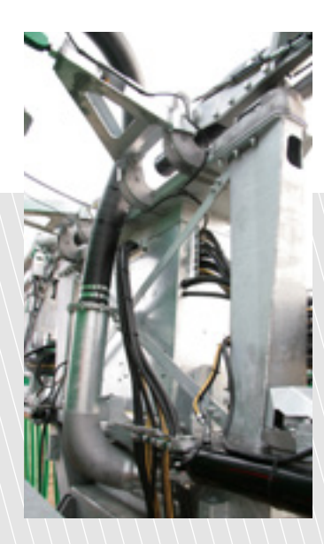
The boom has a simple central frame with no moving parts.